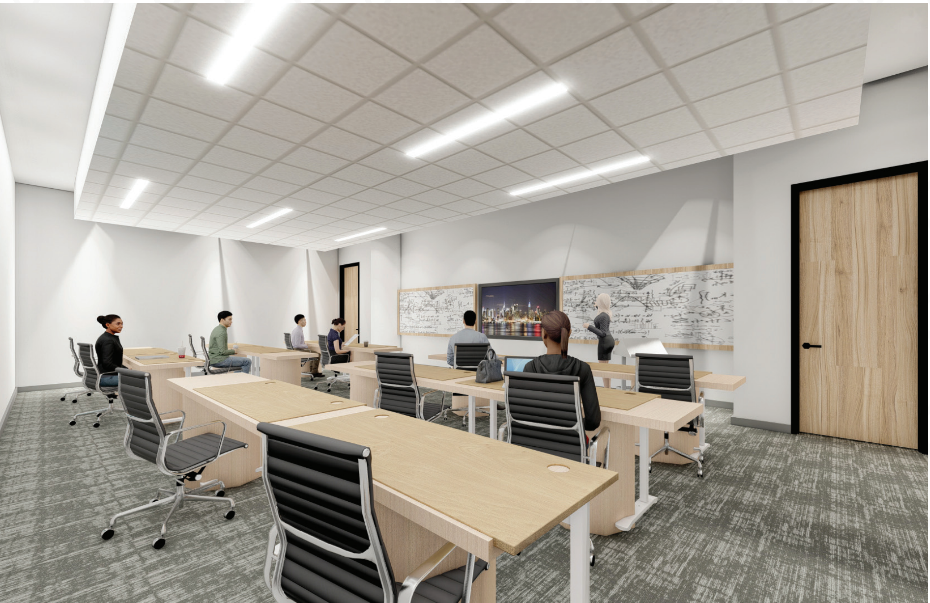
INTERIOR CONFERENCE ROOM